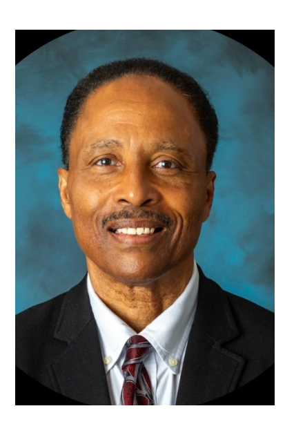
VP for Workforce Development & Industry Partnerships