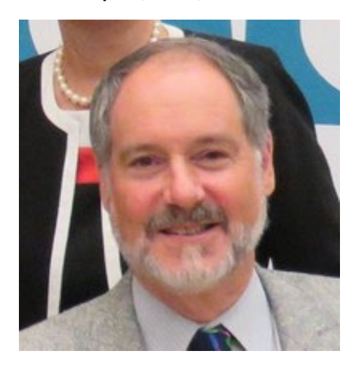
Retired Cofounder and Consultant of GeneDX