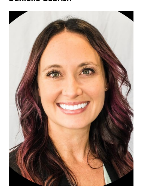
Director, Clinical Biologics

Biopharmaceutical Development AstraZeneca