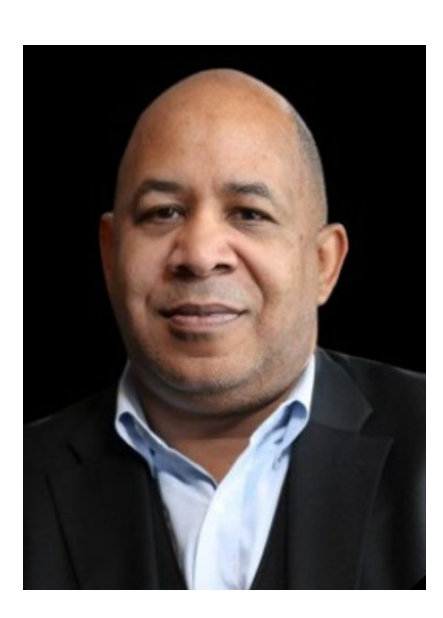
Director of Development and Philanthropy

The National Academy of Public Administration