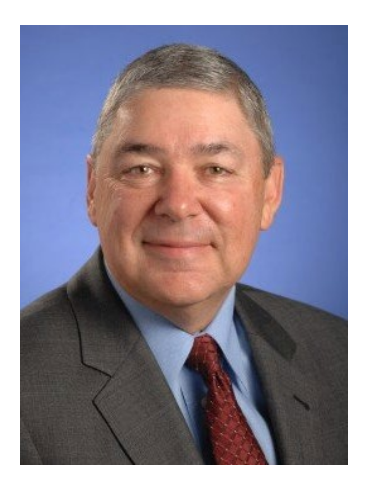
Retired, Founding Partner