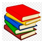
Enrollment Status of Credit Students