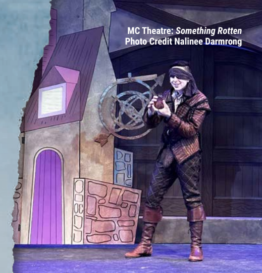
MC Theatre: Something Rotten