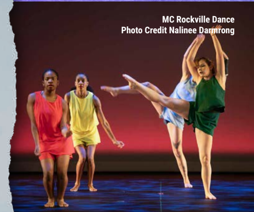
MC Rockville Dance

Robert E. Parilla Performing Arts Center Rockville Campus montgomerycollege.edu/pac