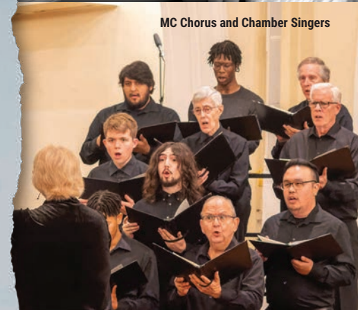
MC Chorus and Chamber Singers