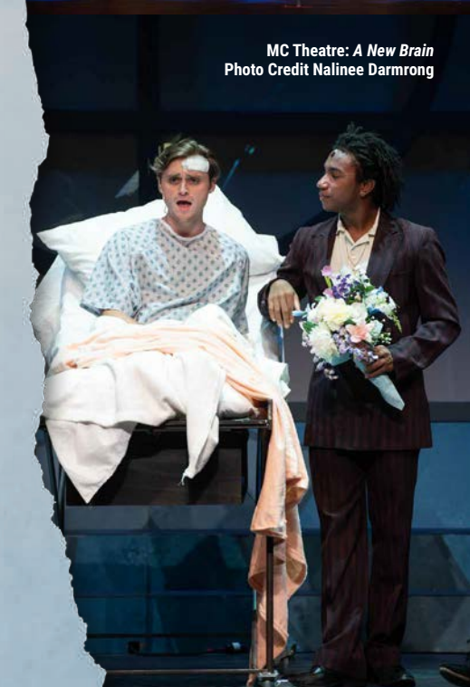
MC Theatre: A New Brain

Robert E. Parilla Performing Arts Center Rockville Campus montgomerycollege.edu/pac