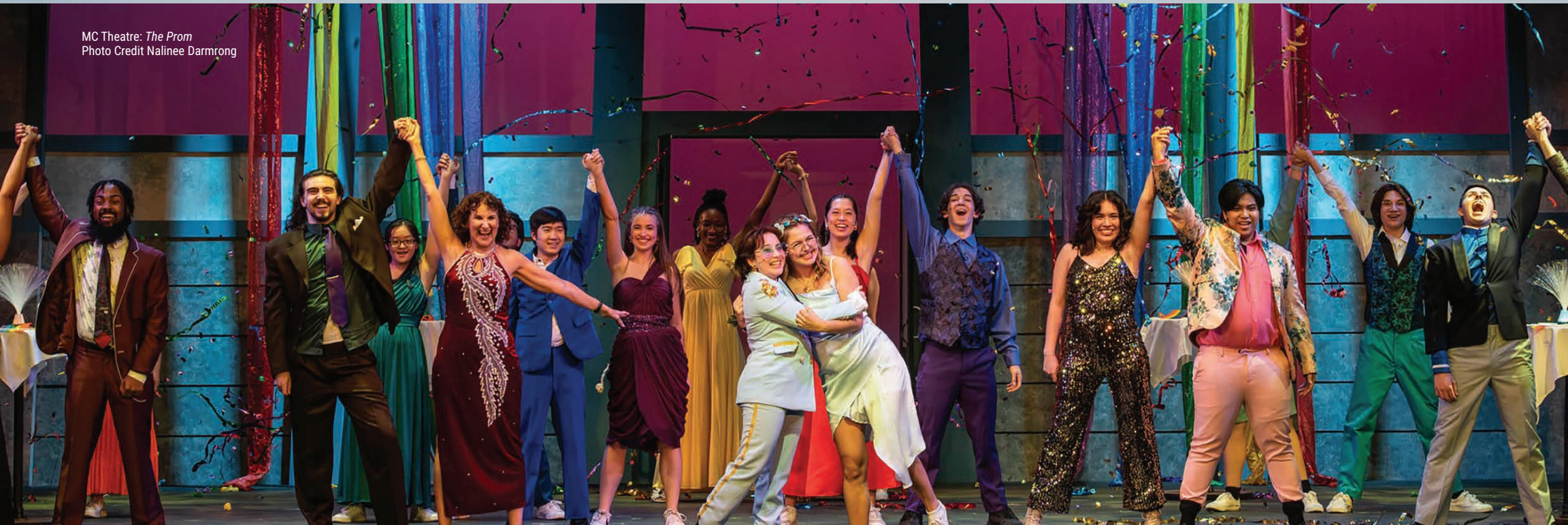
MC Theatre: The Prom

Montgomery College campuses are tobacco free. Events are subject to cancellation due to inclement weather or unexpected College closings. Montgomery College is an academic institution committed to equal opportunity. Produced by the Office of Communications | 02/2025